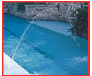
Single 5/16" stream