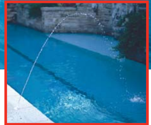
Single 1/4" stream