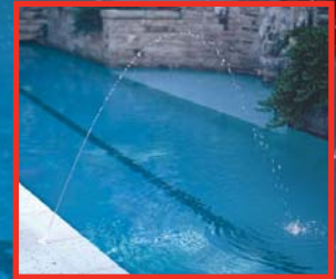
Single 3/16" stream