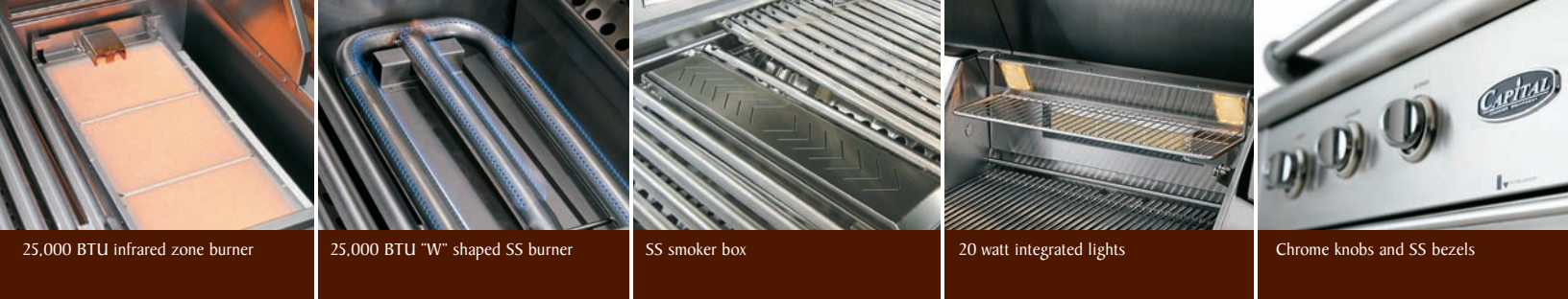
25,000 BTU infrared zone burner